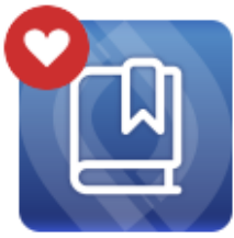
Follett Destiny Discover